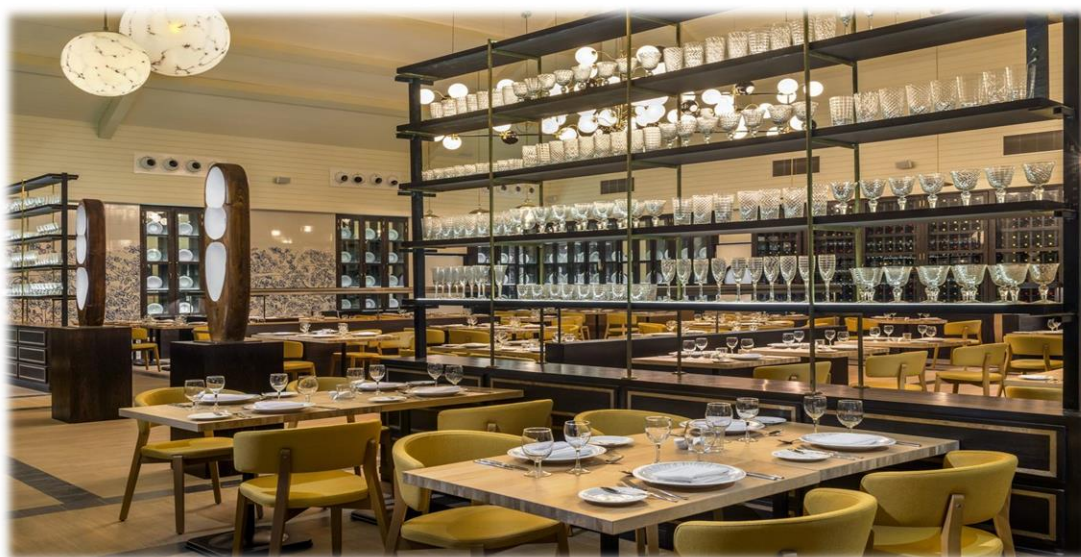
La Locanda , Italian a la carte restaurant open for dinner.