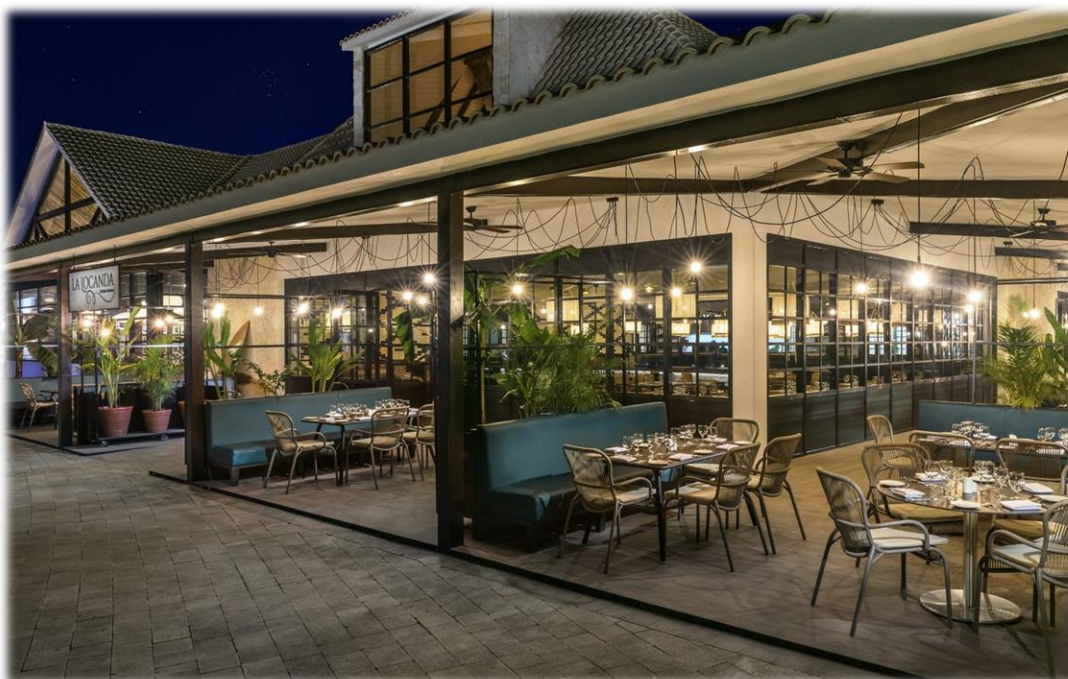
Margarita , Mexican a la carte restaurant open for dinner.

Pez Vela Restaurant , A la carte restaurant located on the beach with a warm, tropical atmosphere and Caribbean flavors cooked up by the chef.